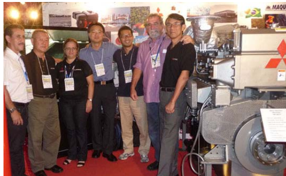
Mitsubishi Engine & Maquipel Booth at IET Show